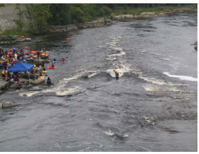
Dane Jackson backsurfing. Viewed from spectator area on the Rt. 3 bridge.

advised them to create a feature somewhere other than 3 Wave (complete article available in FLOWlines , August 2003) However, others believe that the feature is washing out and will be gone in a few years anyway. In addition, there is hope that once the modification of one wave is completed and proven successful, state money will be available to create or modify other features. Hole Brothers is also said to be washing out as the mostly demolished dam that creates it decays. Some fear that without modification there will be no solid park and play features in Watertown within the next decade.