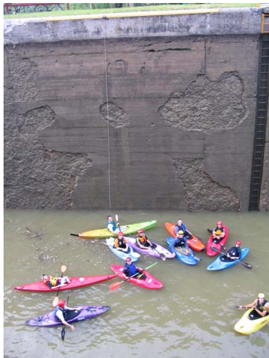
FLOW's Trip Through Lock 32, May General Meeting.