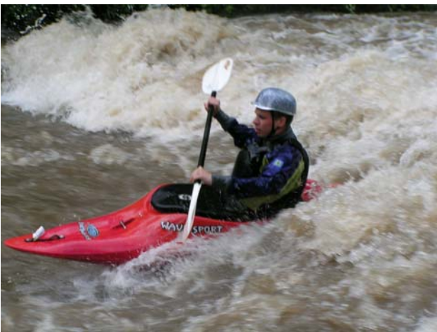
Freakshow on the Huge Secret Wave, some high level, somewhere near Roch.