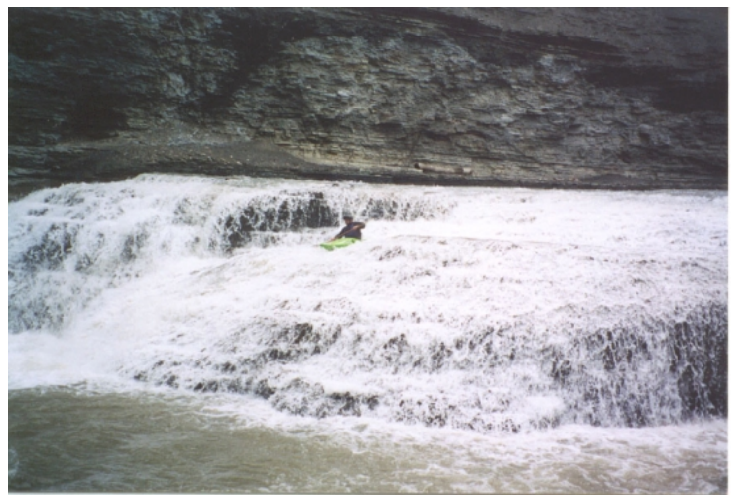
Don Cochran running the falls on South Branch of the Cattaraugus

From 100 yards up stream we could see water spitting up from the horizon of THE FALLS. The stair-like portage on river right was swallowed up to the canyon wall. There was a micro eddy across the way on the river left, big enough for one boat and