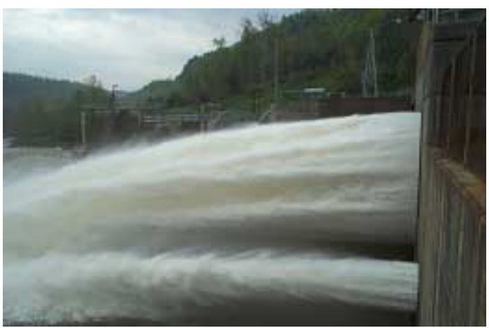
Gauley Dam Up Close

Paddling the Meadow on Thursday put us in Gauley neighborhood, so we moved camp to the base of Gauley dam. No visit to West Virginia is complete, after all, without a pilgrimage to Gauley dam. Rebuilt to add hydropower, a new generator obstructs the classic view of the three output flumes, but a walkway now lets you walk right up to the two flumes that still run. Unrestricted, we could walk up close enough to touch the powerful canons on water if crazy enough.