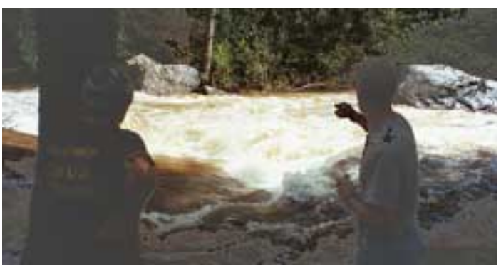
Scouting the Cranberry

So off to a river...we headed for the Cranberry. Bill's route took them over a bridge now ½ under water...a clue we were en route to an adventure. We arrived to see six boaters taking off early in their run – too much water for them, they say. And two more came walking down the road, but carrying only one boat...seems the other boat (and paddle) was lost.