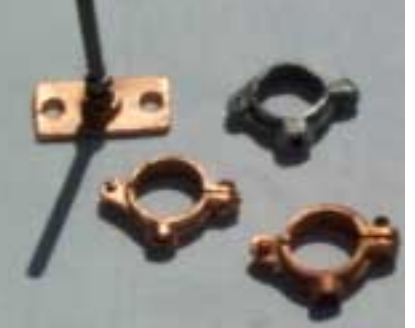
Hanger Types and Mount

I have stumbled across a cheap and easy way to insure that your paddle will still be on your roof rack after the shuttle.You'll need two inexpensive plumbing pieces called "pipe hangers" or "split rings". They come in various sizes (1 in., 1 \frac{1}{2} in., and 2 in. diameter).