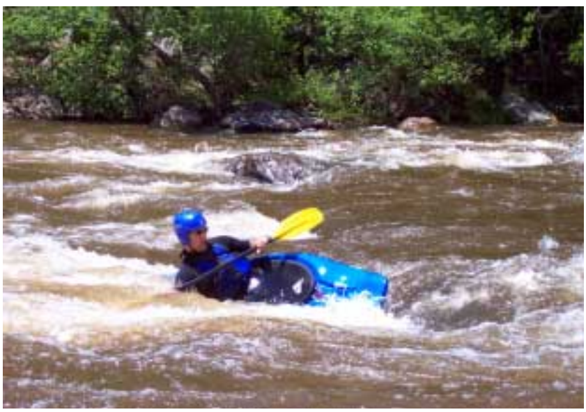
Wade Bowman Surfing