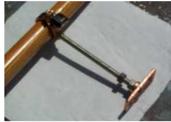
Hanger Mount On Paddle

You can also add a base that is sold along with the hangers and a short piece of threaded rod to get the paddle the correct height off the roof or rack. You don't have to mount them anywhere at all. Simply lock a cable in with the paddle, and lock your paddle to a tree! They can be mounted to the top of popup trailers, on bumpers. But real men just drill holes in their van roof. Yes, they work on canoe paddles too!