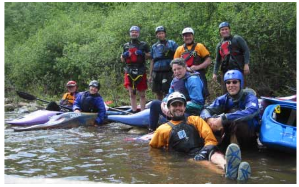
One little fishy, two little fishies, three little fishies...