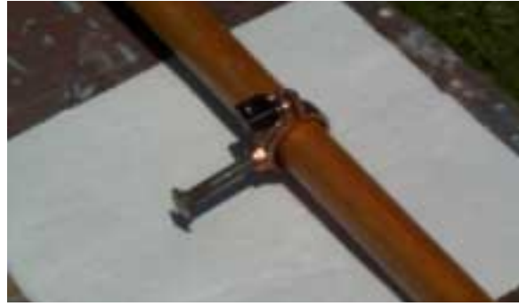
Hanger and Carriage Bolt On Paddle

deep in the woods and you have the only vehicle. And lets face it - if they want it that bad they are gonna get it anyway.