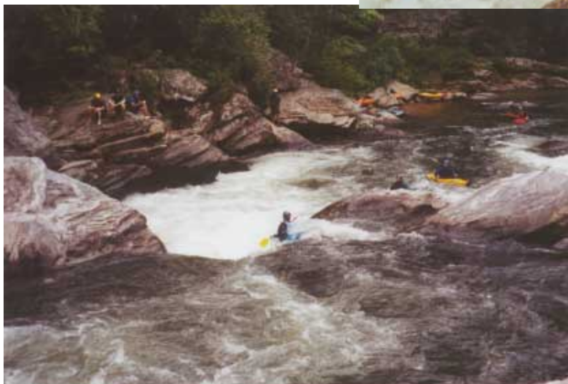
Seven Foot Falls, Chatooga River