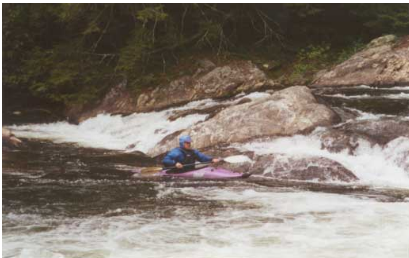
Ed Boggs below Woodall Shoals, Chatooga IV

FLOW member price $55 00 per hammock* not including frame